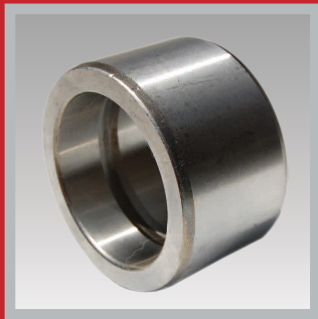
TURNED STEEL SLIDING BEARING, HEAVY-MAINTENANCE